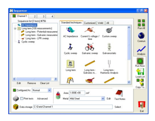
Sequencer – available techniques are displayed to the right, they are added to the sequence list on the left. A sequence list can be copied across channels, or channels can be treated individually.

At the heart of an ACM system is a Sequencer and Core Running application, now into Version 5 the emphasis is on reliability. Working in unison, Sequencer setups up a sequence of techniques and Core Running collects data from a sequence of techniques. The Sequencer was designed to be easy to use, with an intuitive interface, one that is common across the range from Data Collection to Analysis; learning effort is kept to a minimum.