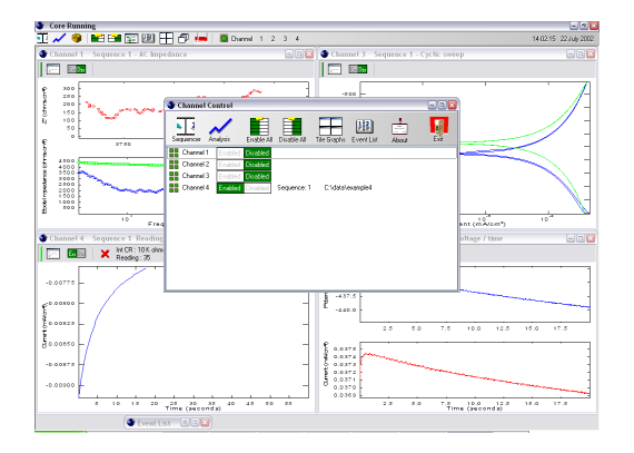
Core Running – data collection control at your finger tips. View each channel individually, or tile all, instantly display any one of the last 10 collected tests, printing on operator demand.

Test Notes allows entry of a complete ASTM G107 notebook, hundreds of optional fields can be entered to catalogue your experiment, metals, temperature, environment, etc..., fields are saved in a global database for searching and cross-referencing at a later date. Onto data collection, pressing one button in the sequencer Run All starts data collection: