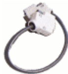
2 Serial Cables